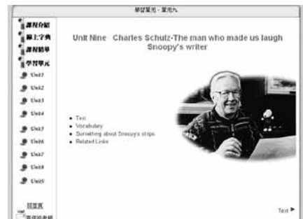
Figure 3. The homepages of Unit 2 to Unit 9